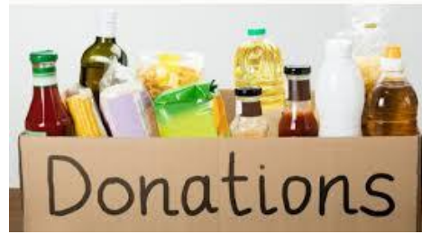
How to support your local foodbank

Thank you to everyone who has contributed so far to the foodbank box located in the lobby. This will be emptied periodically and contents distributed to the various foodbank organisations in town. Please ensure though, that all donations are in date.